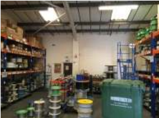
Unit 6 Internal photograph.

The tenant will be responsible for a contribution towards the Landlords reasonable legal costs incurred.