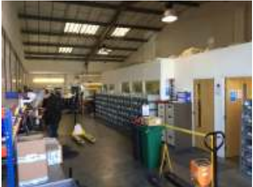
Unit 5 Internal photograph.