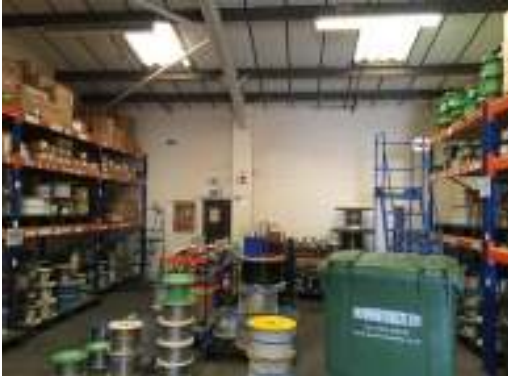
Unit 6 Internal photograph.

The tenant will be responsible for a contribution towards the Landlords reasonable legal costs incurred.